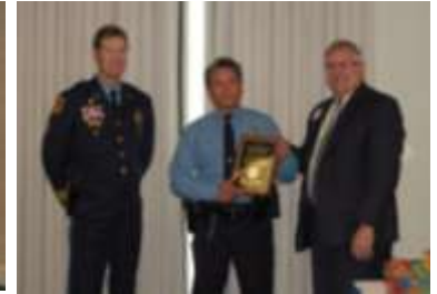
Kansas City Police Department