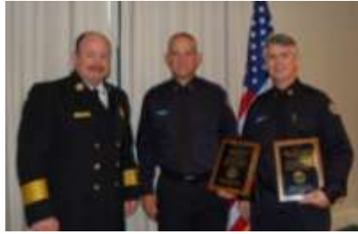
Kansas City Fire Department