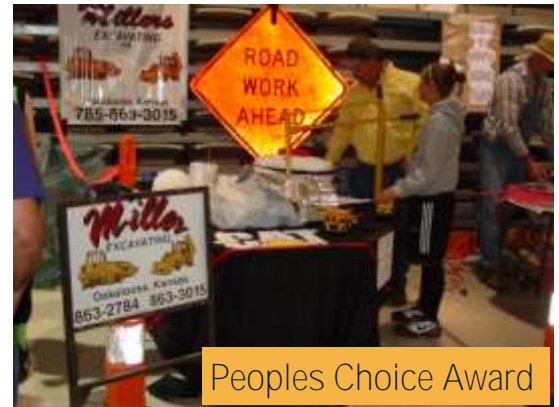
Peoples Choice Award